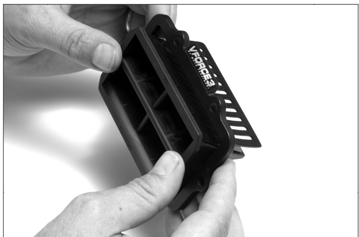
Step 12 ) With reeds in place, push reed cage through flange until locating tabs snap into their openings.