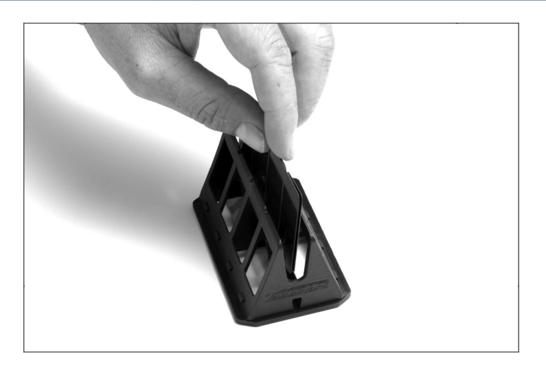
Step 7) Place two reeds in center of reed cage, making sure they are at the bottom.