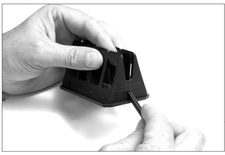
Step 8) Separate reeds and place new retaining bar (supplied) on an upward angle making sure it fits between the reeds.